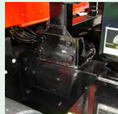
• Angle Iron