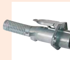
Dual Conductor Plug Set

Convenient options and accessories for one-stop purchases.