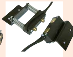
Contact Plates: Reduce trailer wiring