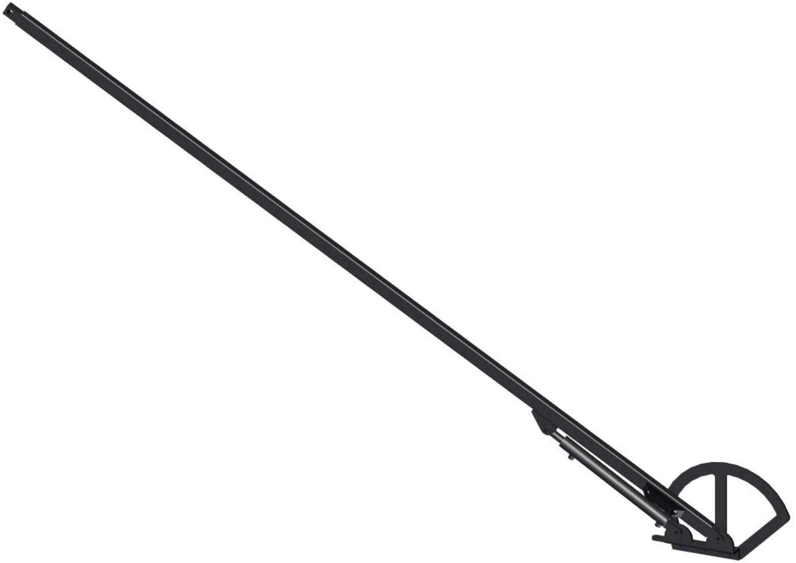
DB-20. Pivot Mount Assembly - Left