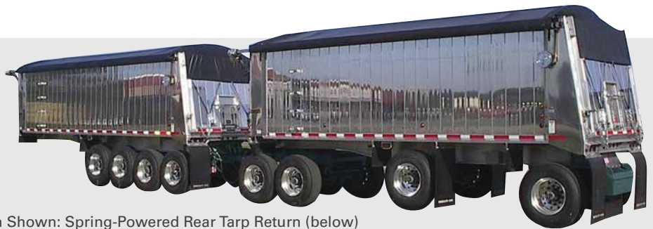
Option Shown: Spring-Powered Rear Tarp Return (below)