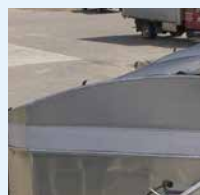
Solid (Aluminum): Rigid installation