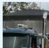
Fabric: Recommended for most applications